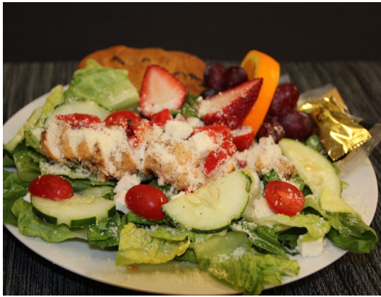
Caprese Chicken Salad