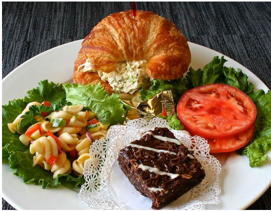
The Deli Box