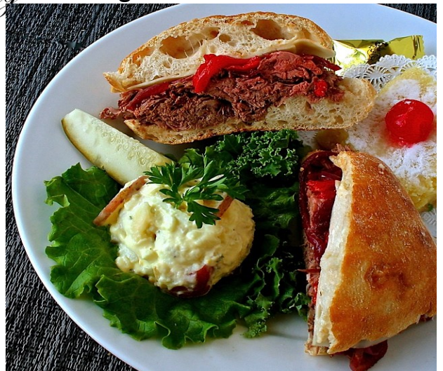
Angus Steak House Ciabatta