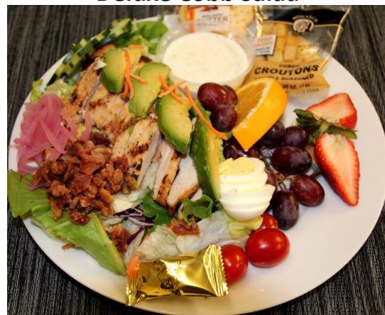
Deluxe Cobb Salad