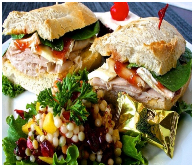
Honey Smoked Turkey & Brie Baguette