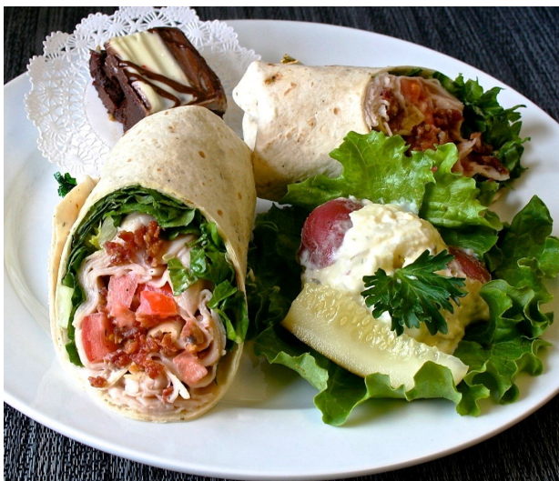
Avocado Rancher Wrap