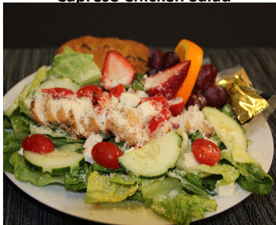
Caprese Chicken Salad