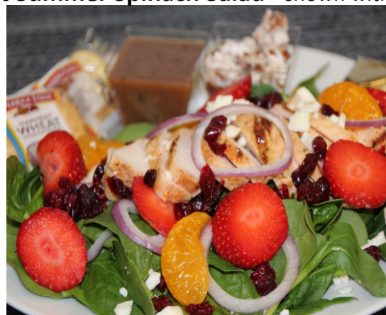
Sweet Summer Spinach Salad *shown with Chicken