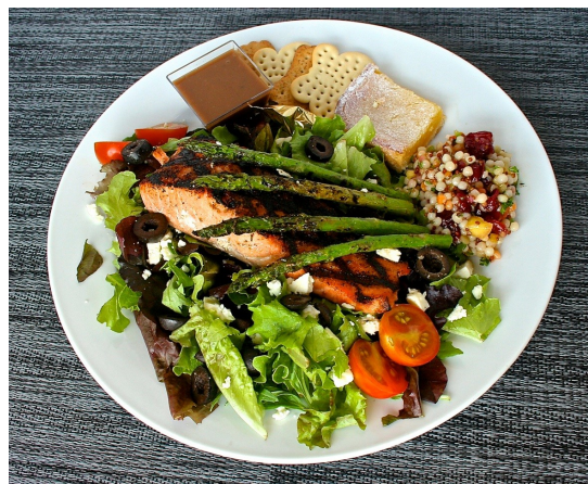
Tuscan Grilled Salmon Salad