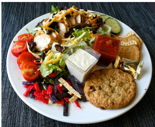
The Fiesta Tortilla Salad