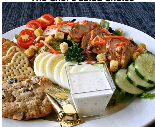
The Chef's Salad Choice